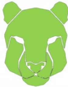
Cheetham House Bravery & Resilience