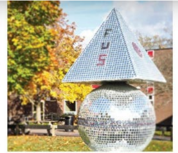
- Advertisement Feature -