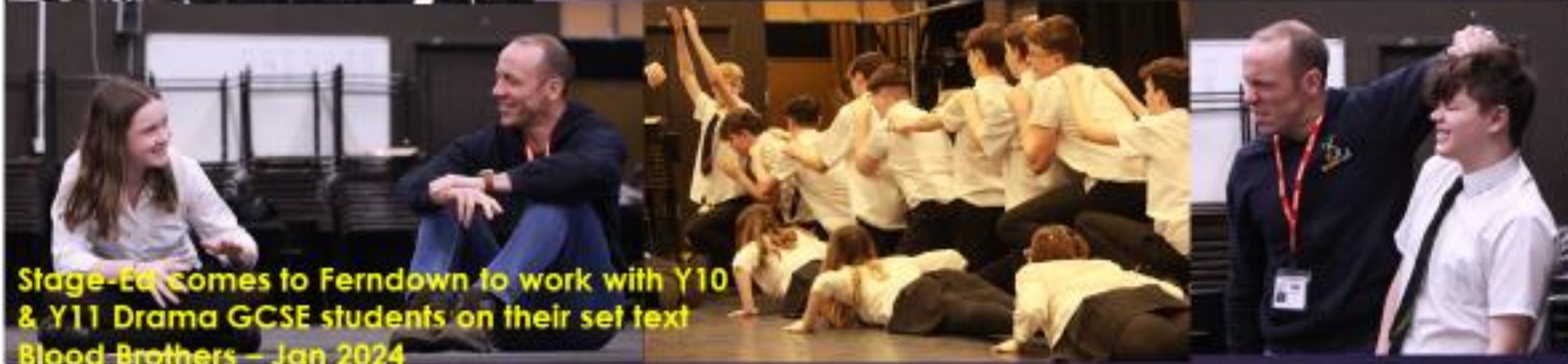
Stage-Ed comes to Ferndown to work with Y10 & Y11 Drama GCSE students on their set text Blood Brothers – Jan 2024