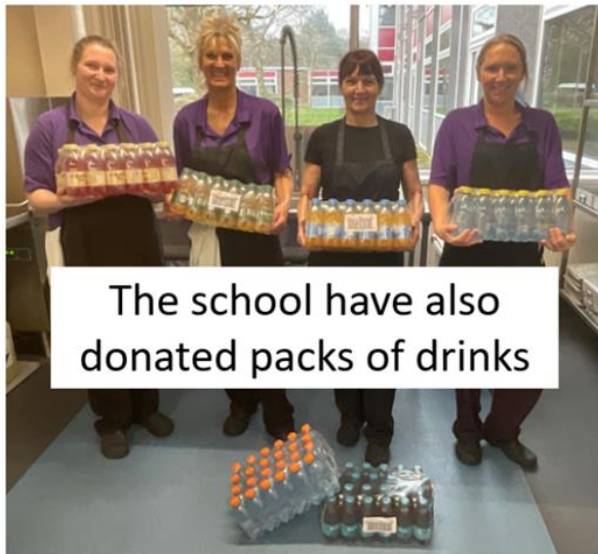
The school have also donated packs of drinks